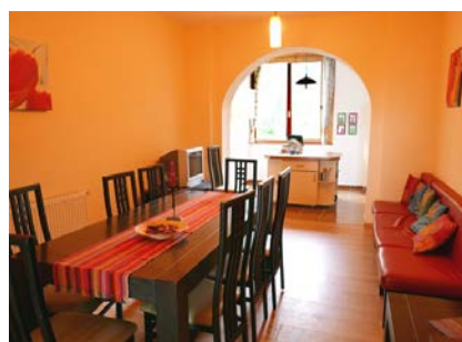
The refurbished Skills Room at the Hungarian School for the Deaf No.2 that was damaged by a plumbing leak from above the room.