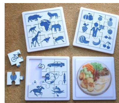
Selection of laser cut, engraved and colour printed acrylic jigsaws for early years speech and language therapy.

Over the past year we have been developing methods of laser cutting and engraving acrylic sheets for jigsaws. We also make acrylic jigsaws with high resolution coloured images. We are able to produce all the necessary software ourselves, using specialist firms for the laser work and the printing. There are now 20 laser engraved and 6 colour printed jigsaws available.