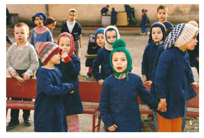
A Romanian orphanage visited by the CSF in 1992.