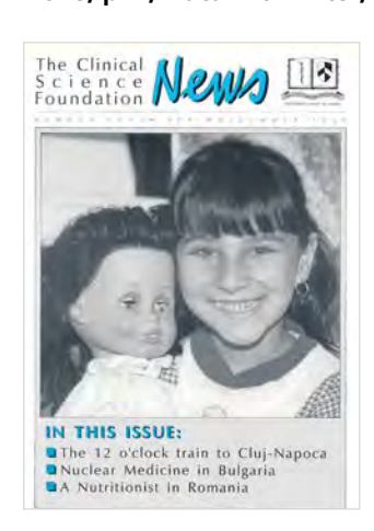
A change of format (1995).

We started to produce Newsletters in October 1991, one year after our first visit to Romania. We wanted to let our supporters know what we were doing with their money and what life was like in Romania. The first issue was on A5 paper (half the size of this page), 20 pages long, with 9 short articles and 11 pictures. In 1995 we changed to an A4 format, with improved printing. Now, a typical Newsetter will have probably ten long articles and over 30 images. Here we present a few extracts from memorable past articles.