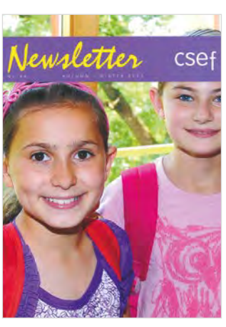
A recent format (2013).