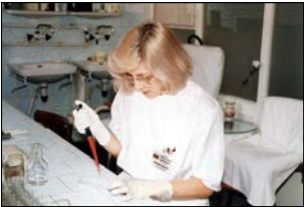
Safety equipment was donated by CSF to pathology laboratories in Cluj-Napoca.