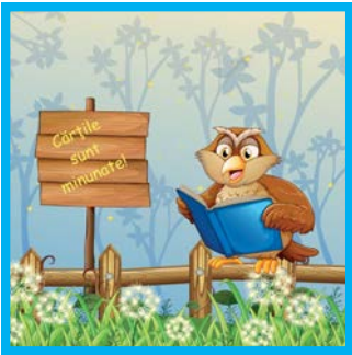
One of the new square murals (size: 100 cm x 100 cm) to be installed in 2017, extolling the reading of books!