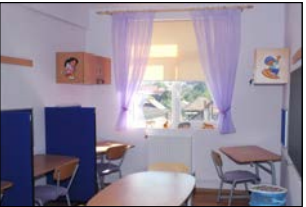
In recent years the CSEF has been upgrading facilities used by children with autism.

In 2001 The Clinical Science & Education Foundation (CSEF) was established as a UK registered charity (No. 1086712). The CSEF took over all the clinical projects of the CSF, but extended the scope of its work to include improving the education of deaf children in three special needs schools in Cluj-Napoca. We took them hearing aids, set up a special earmould laboratory and provided glasses for those children having difficulties with their sight. Over this period we gave hearing aids to 400 children and carried out 750 vision checks.