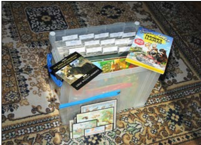
An activity box created on the theme of the living world ready to be given to a school.