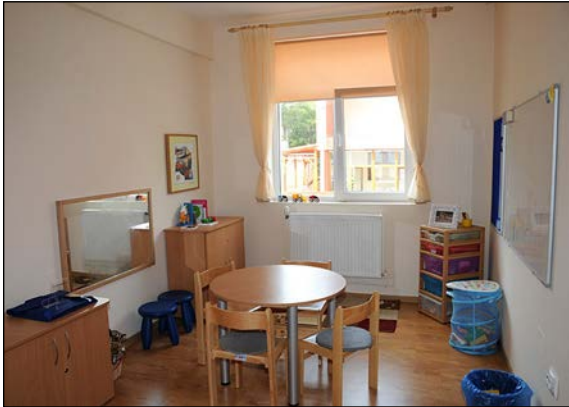
A refurbished themed therapy room used during therapy for children with autism.

Essential grants for this work were provided by three charitable groups.