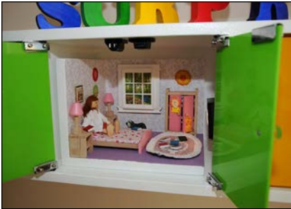
A diorama of a miniature model bedroom made with dolls house furniture.