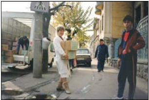
CSF delivering medical supplies to a Romanian children’s hospital 20+ years ago.

It is our intention now to concentrate solely on educational projects. We want to continue to develop modern, creative learning materials, taking into account the specific language, communication and cultural needs of children in central and eastern Europe. That is, continuing and enhancing the educational work we do now.