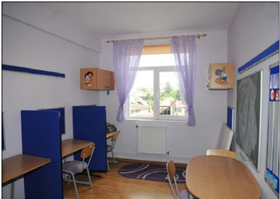
One of the classrooms that was refurbished at the Transylvanian Autism Association.

At the (Hungarian) School for the Deaf No. 2 we were able to have the much used Skills Room re-painted. In addition, two stair ways and two long corridors where all of our educational posters are on display were also refurbished.