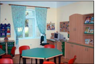
In 2001 the CSEF started upgrading classrooms at schools for the deaf.