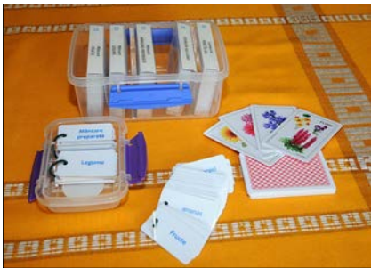
A selection of the speech and language cards produced in the form of ID cards.